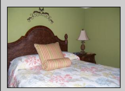
1500 Boardwalk Ocean City, NJ 08226