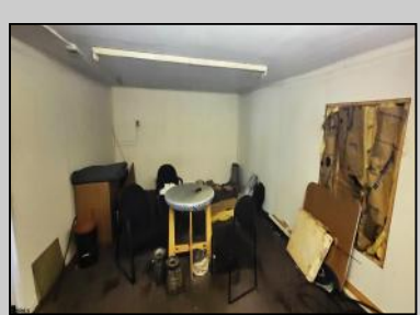
384 Zion Road Egg Harbor Township, NJ 08234