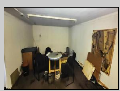
384 Zion Road Egg Harbor Township, NJ 08234