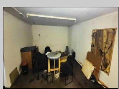
384 Zion Road Egg Harbor Township, NJ 08234