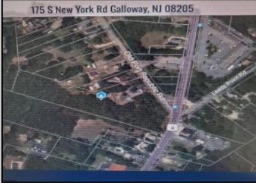
175 S New York Rd Galloway, NJ 08205