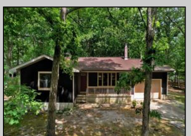
232 Asbury Egg Harbor, NJ 08234