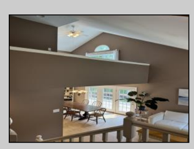
116 Parkwood Dr Linwood, NJ 08221