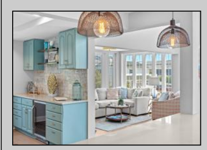
2118 First Avalon Boro, NJ 08202