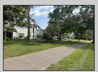
2601 Falcon Mays Landing, NJ 08330