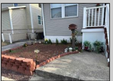
111 Loraine Pleasantville, NJ 08232