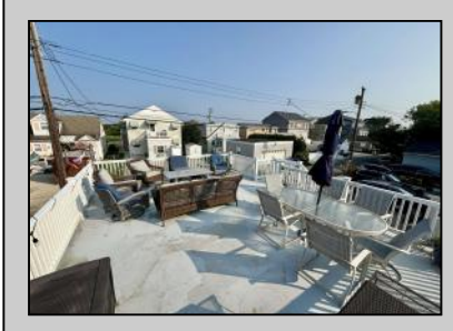
2336 Simpson Ave Ocean City, NJ 08226