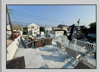
2336 Simpson Ave Ocean City, NJ 08226