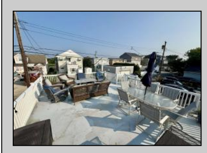
2336 Simpson Ave Ocean City, NJ 08226