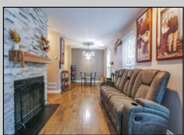
1542 Hamilton Court Mays Landing, NJ 08330