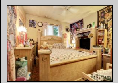
1178 Harding Buena Vista Township, NJ 08310