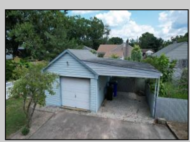
424 Pratt Hammonton, NJ 08037