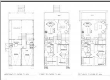
GROUND FLOOR PLAN FIRST FLOOR PLAN SECOND FLOOR PLAN