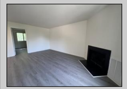
22 Cresson Woods Pleasantville, NJ 08232