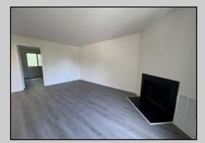
22 Cresson Woods Pleasantville, NJ 08232