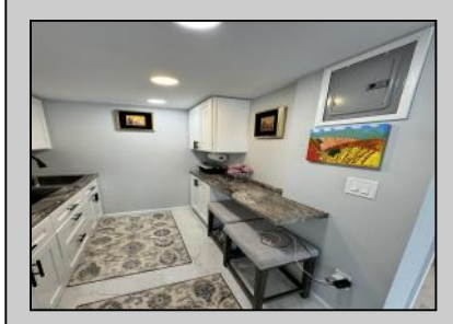
3501 Boardwalk Atlantic City, NJ 08401