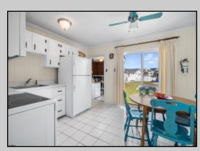
129 Clipper Ocean City, NJ 08226