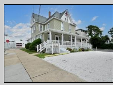
820-822 Shore Rd Somers Point, NJ 08244