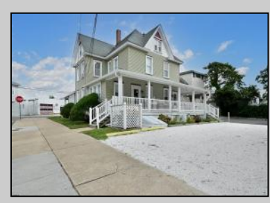
820-822 Shore Rd Somers Point, NJ 08244