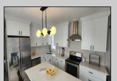
112 31st Brigantine, NJ 08203