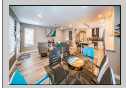
Ocean City, NJ 08226