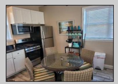
231 33rd Unit C Brigantine, NJ 08203