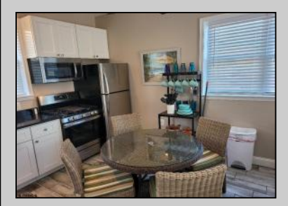
231 33rd Unit C Brigantine, NJ 08203