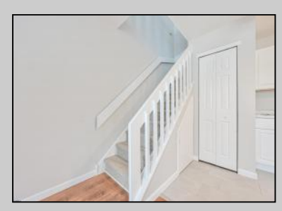
305 Newtowne Pleasantville, NJ 08232