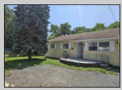
6753 Washington Egg Harbor Township, NJ 08234