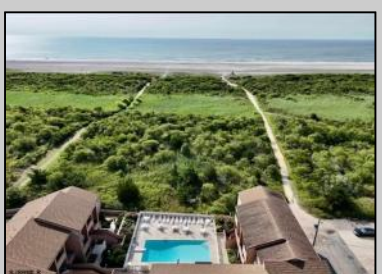
330 42nd St S Brigantine, NJ 08203