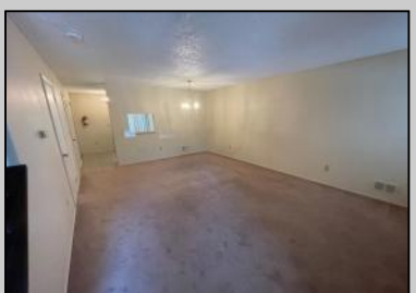
212 Patriots Galloway Township, NJ 08205