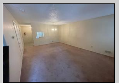
212 Patriots Galloway Township, NJ 08205