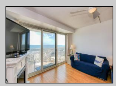
322 Boardwalk Ocean City, NJ 08226