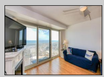
322 Boardwalk Ocean City, NJ 08226