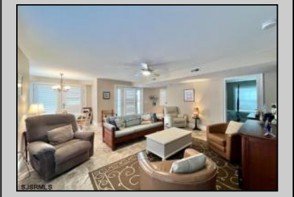
1024 Ocean Ocean City, NJ 08226