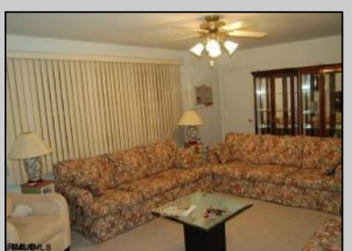
705 #A11 Dorset Ventnor Heights, NJ 08406