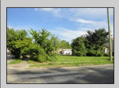
523 Shaw Pleasantville, NJ 08232