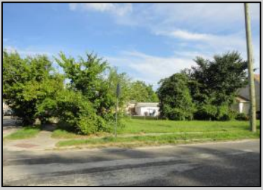
523 Shaw Pleasantville, NJ 08232