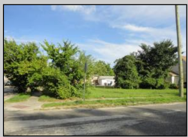
523 Shaw Pleasantville, NJ 08232