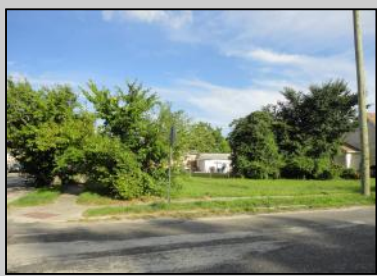
523 Shaw Pleasantville, NJ 08232