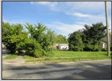
523 Shaw Pleasantville, NJ 08232