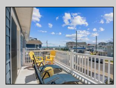
223 10th St N Brigantine, NJ 08203