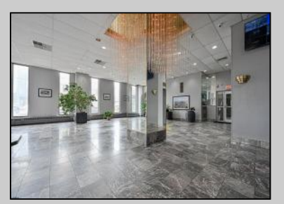
3817 Ventnr Atlantic City, NJ 08401