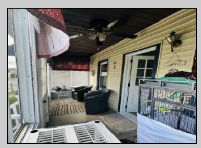
40 Pleasant Ave Pleasantville, NJ 08232