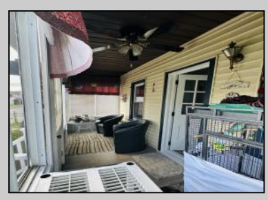
40 Pleasant Ave Pleasantville, NJ 08232