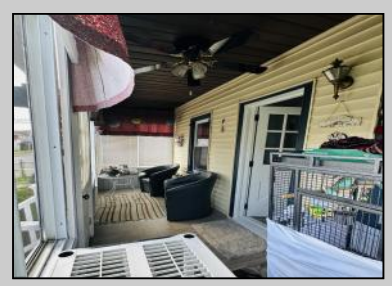
40 Pleasant Ave Pleasantville, NJ 08232