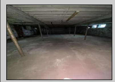
296 Wheat Rd Vineland, NJ 08360