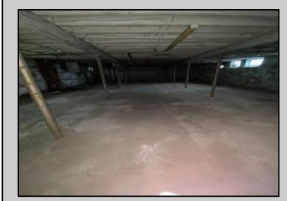
296 Wheat Rd Vineland, NJ 08360