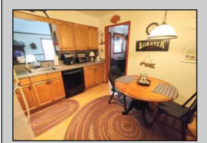
2509 Herbert Northfield, NJ 08225