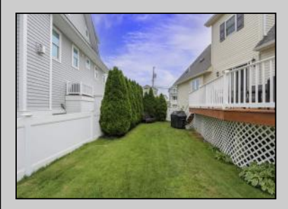
101 Victoria Ocean City, NJ 08226